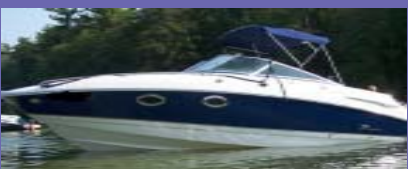
2000 Chaparral Boat 285 SSI, 29 ft., Twin 350 Mags, Sleeps 4, AC, on Triple axle trailer.