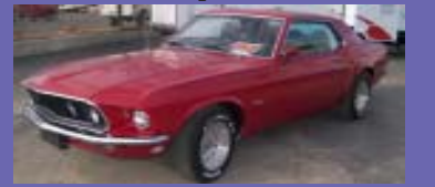
1969 Ford Mustang Coupe w/fresh 351 windsor engine, automatic transmission, kenwood stereo & 128k actual miles.