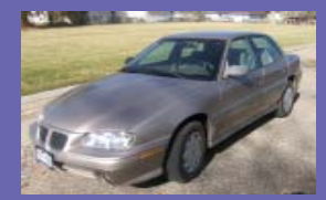
1996 Pontiac Grand AM LE 4-Door 103k Miles.