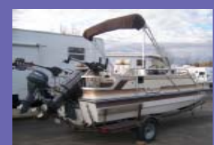
1991 PlayCraft 20' Deck Boat w/ Yamaha Outboard & Trolling Motor.