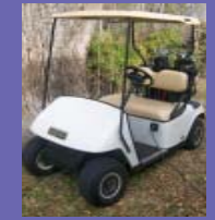
EZ-Go Electric Golf Car w/Good Batteries & Charger.

Portable Swamp Cooler. Display Racks & Shelving. Lanier Gondola Shelving & Wall Pegboard Units-sold in groups. Storage Shelving, Work Benches, Tables & More. Steel 4-wheeled Cart & others. Hydraulic Lift Dollies, Ladders, etc. BilJac 5-Ton Joist Jack. Hein Werner 30-Ton Hydraulic Jack. Royal Couplamatic Hydraulic Hose Making Machine. QTY. Hose Material, Vacuum, Air & Water types. New Multi-Quip-Mikasa Parts Inventory (over 5K in cost) for Generators, Compressors, Pumps, etc. New Briggs & Stratton Small Engine Parts Inventory (over $2,500 in cost). New Oil & Air Filters for Bobcat, Ditchwitch, Multiquip & Ford Tractors. Portable Electric Winch.