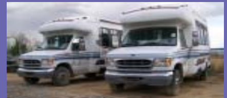
(2) 1999 Ford E-450 12 Passenger Van/ Buses Super Duty Triton V/10 Engines.