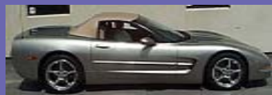
2000 Corvette Convertible, 39k miles, 6-speed.