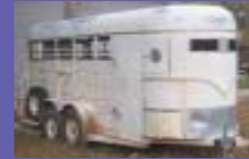
1980 WW 4-Horse Trailer.

Portable Hotsy Hot Water Wash System w/ 20 h.p. Honda Electric Start, 500 hours, 500 gallon fresh water tank mounted on tandem axle utility trailer, 4.5 GPM, 4,800 PSI, with hose reel on 2000 tandem axle trailer.