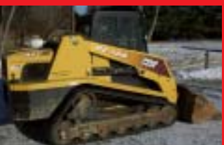
1981 CAT D3-B Dozer, w/ Rippers, Newly rebuilt Engine. 2006 John Deere 317 Skid Steer Loader, aprpx 900 hours.. 2006 John Deere 320 Skid Steer Loader subject to prior sale. 2004 ASV RC100 Rubber Track High Track Skid Steer Loader, s/n RSD00496, approx hours 2342.