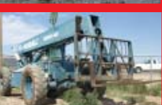
Gradall 534 D 6-42 Reachlift, approx 3484 hours, s/n 0588236. Takeuchi TBO-25 Mini-Excavator on rubber tracks s/n 1258200. Condor Calavar 58 All-Terrain Boom/Man Lift, 4 wheel drive. Bobcat 540 Skidsteer Loader, 20 h.p Kohler gas engine.