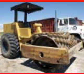
1987 John Deere 862B Elevating Scraper, 300 hous on new differential, 1600 hours on engine, 11500 hours on meter, s/n T0862BX738733. 1998 Hypac C850B 84" Smoothdrum Compactor, recent new engine, 3224 hours, s/n 109B18802289. 1991 CAT CP563 84" Sheepsfoot Compactor, Good Rubber, s/n 2WG01921.