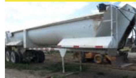
1981 Timpote Model 301A Double Gated Bottom Dump Trailer, 20 Cubic Yard w/ Cramaro Electric Tarp System.