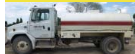
1997 Freightliner FL-70 Water Truck, Diesel, 9 Spd Transmission, approx 64k Miles.