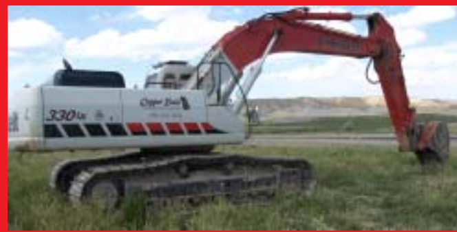
2006 Link Belt 330 LX Excavator, 1 Owner, Subject to prior sale, Quick Coupled Bucket, Aprox. 1920 Hours,s/n K6J61473.