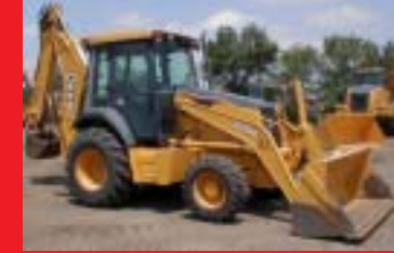
2005 CAT 420 D Loader Backhoe, 4x4, 1 owner, E-Ropss/n CAT0420DEFDP20820, 4 wheel drive. 2004 JD 410G Loader Backhoe, Power Shift, E-Rops, 4x4, approx 3146 hours. 2002 CAT 430 D Loader Backhoe, Extend a Hoe, 4x4, s/n CAT0430DHBK00805. 1984 Cat 140G Motor Grader, w/ Rippers, approx, 8726 hours, s/n 72V06601.