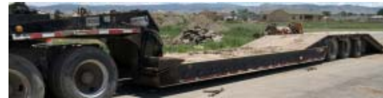
2000 Ledwell 3 Axle Detachable Lowboy Trailer, w/ Winch, Hydraulic Dove Tail, 255-70R 22.5LN Michelin Tires.