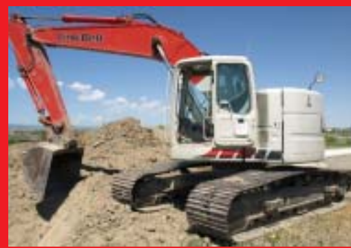
2005 Linkbelt 225 Spin Ace Excavator, 1 Owner, Approx 3073 Hours.